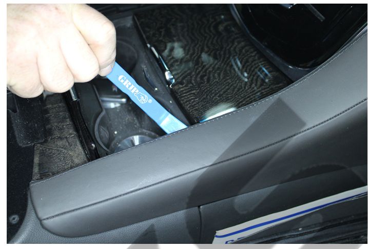
Pry out passenger side center console trim panel.