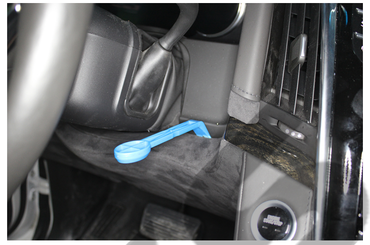
Pry out steering wheel column cover. Disconnect two (2) plugs: park switch, hood latch.