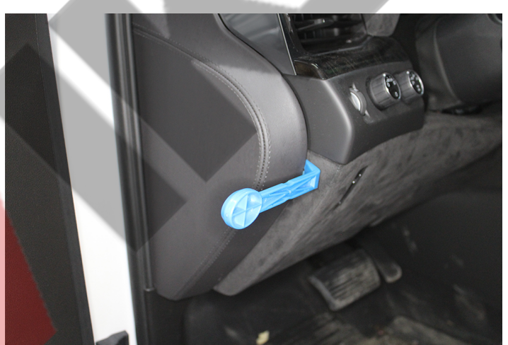
Pry out left side dash cover.