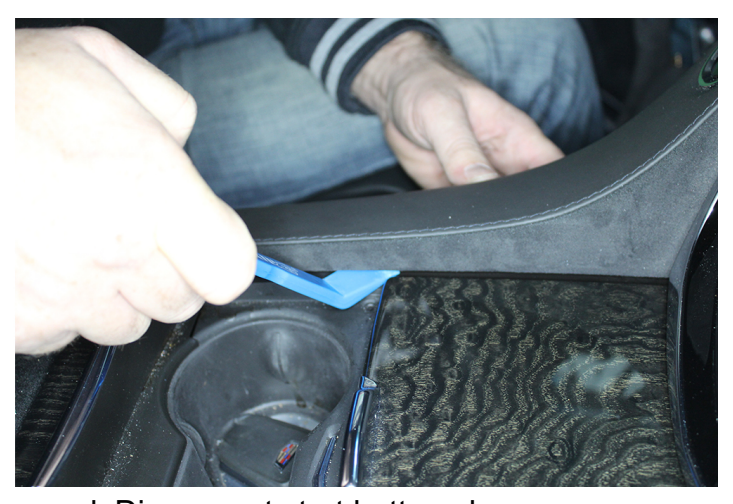
Pry out driver side center console trim panel. Disconnect start button plug.