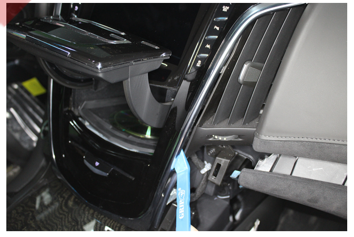
Pry out silver radio bezel to expose radio unit screws. Work your around both sides top to bottom.