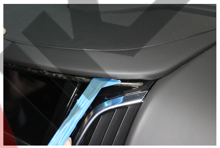
Carefully pry out trim bezel between the screen and the dash.