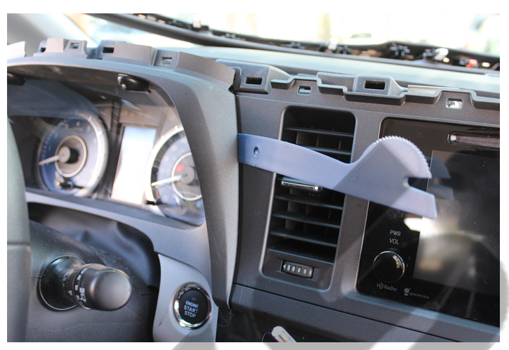
Pry out cluster trim bezel.