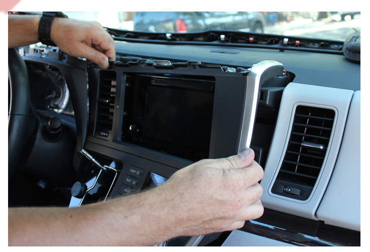
Pry out climate control / screen trim panel. Gently pull to remove it, disconnect two (2) plugs.