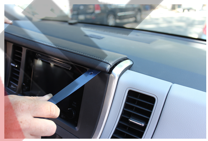
Pry out dash trim panel at the top of the dash.