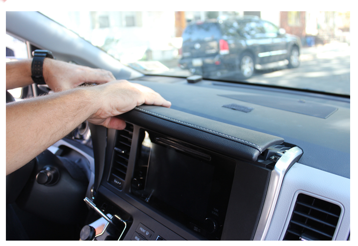
Gently pull to remove top dash trim panel.