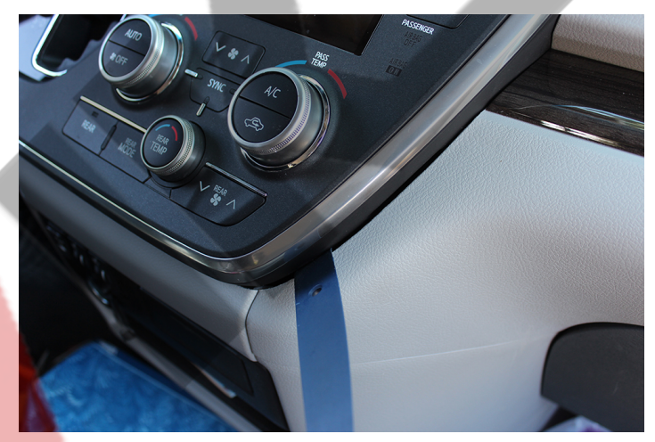
Unfasten gearshift knob. Pry out climate control / screen trim panel.