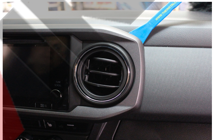
Using a panel prying tool pry out radio trim bezel.