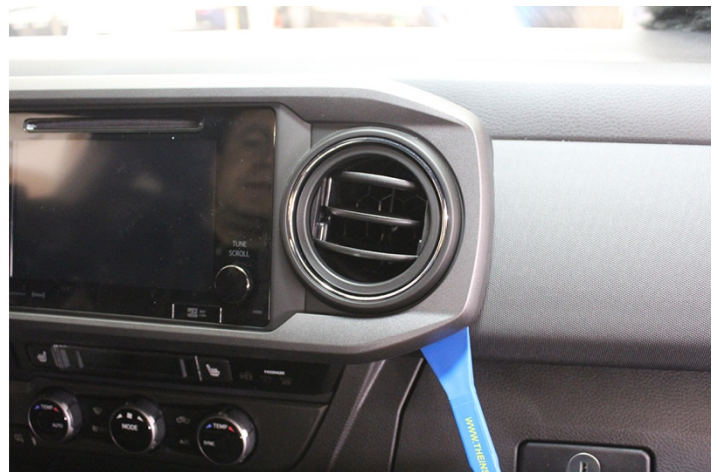
Using a panel prying tool pry out radio trim bezel.