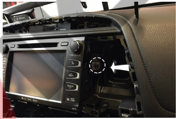
Unfasten two (2) bolts one on each side of the radio unit.