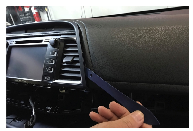
Pry out clock / dash trim bezel.