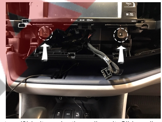
Unfasten two (2) bolts under the radio unit. Slide radio out slowly.