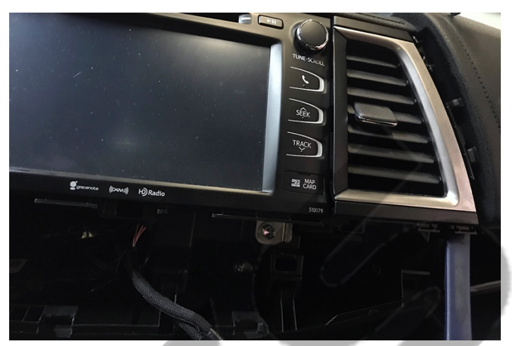
Pry out left and right AC vent.