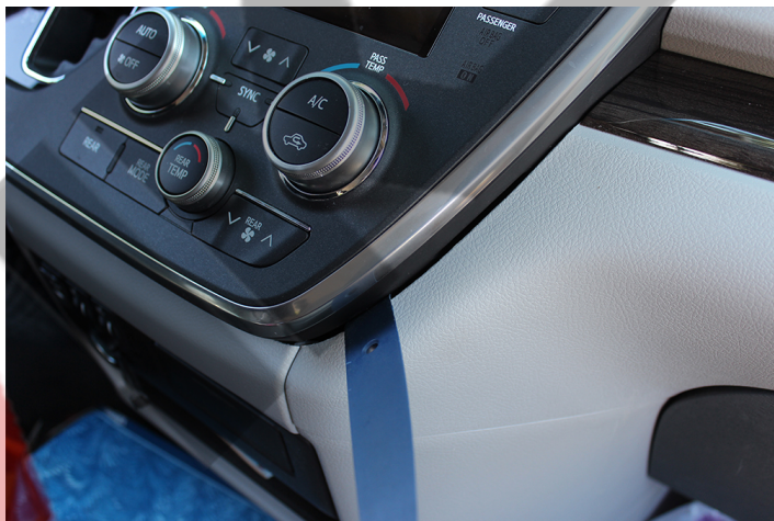
Unfasten gearshift knob. Pry out climate control / screen trim panel.