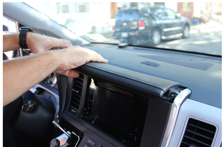
Gently pull to remove top dash trim panel.