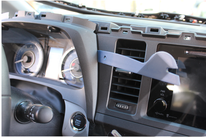
Pry out cluster trim bezel.