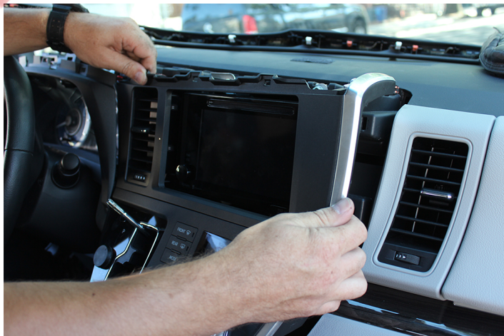
Pry out climate control / screen trim panel. Gently pull to remove it, disconnect two (2) plugs.