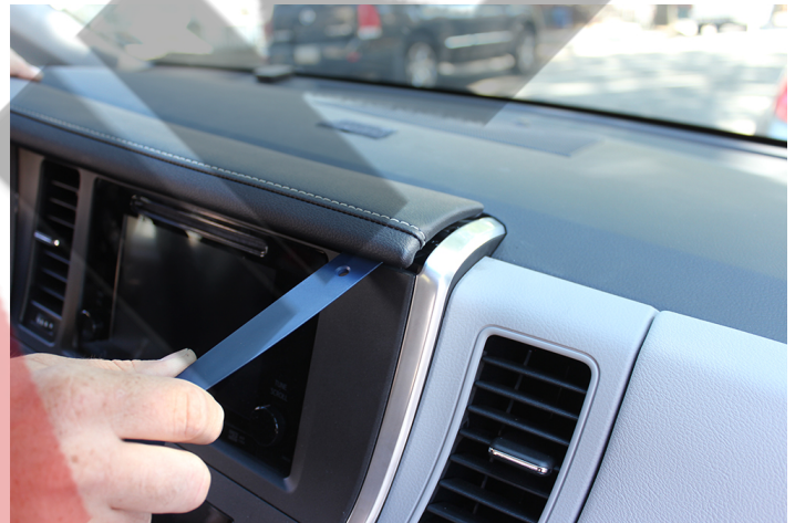
Pry out dash trim panel at the top of the dash.