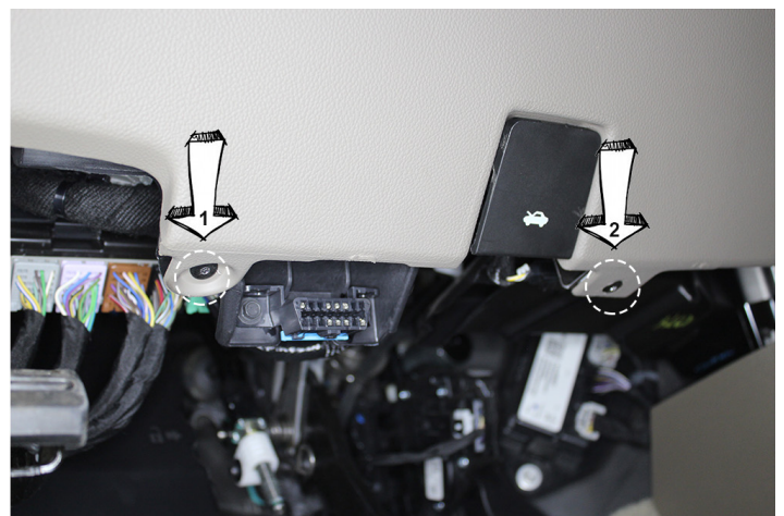
Unfasten two (2) screws at the side of the dash cover. Unfasten two (2) screws under the steering wheel column cover.