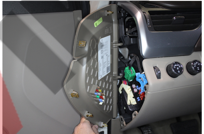
Pry out left side dash cover.