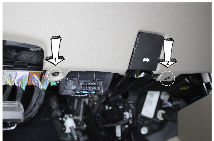
Unfasten two (2) screws at the side of the dash cover. Unfasten two (2) screws under the steering wheel column cover.