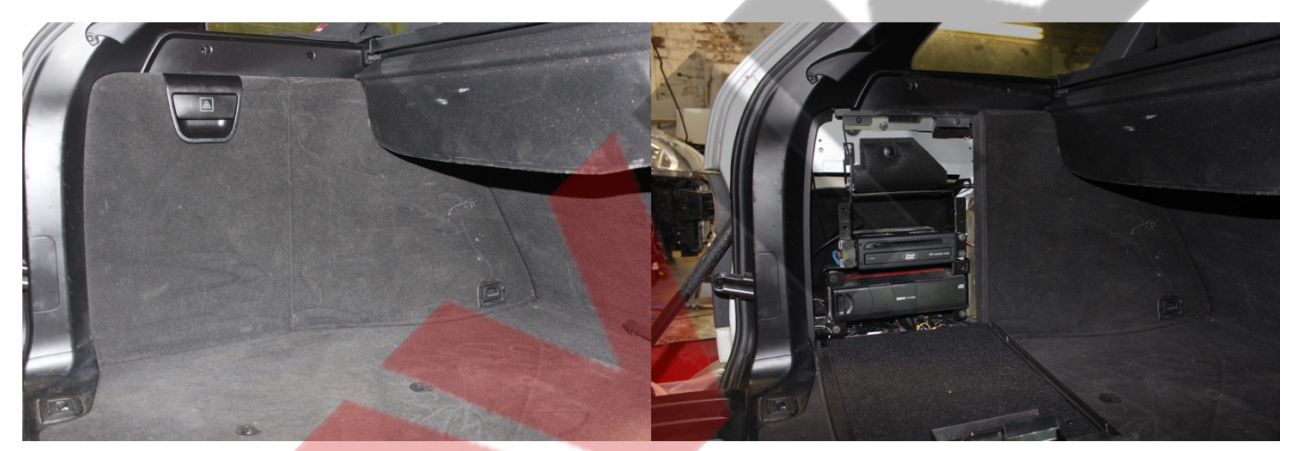
The Navigation DVD-ROM drive is located in the trunk on the left side . Unfasten four (4) screws around the Navigation DVD-ROM .